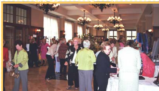
Shoppers galore at the Royal Park Hotel