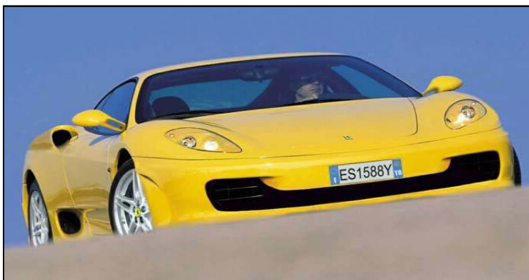
Spend time in the cockpit of a Ferrari F430!