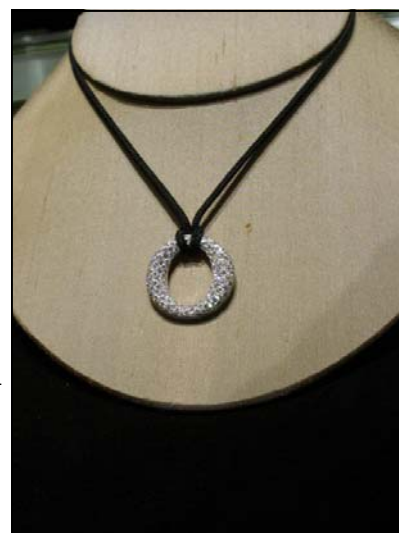
Diamond Necklace from Tiffany & Company